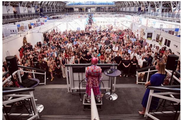
Above (from left): Fashion icon Dame Zandra Rhodes photographed with the winners of New Designers Week 1 Awards; Rhodes delivering her keynote speech in front of the live audience

New Designers ( newdesigners.com ) runs until 5 July for Week One, and from 9 – 12 July for Week Two, at the Business Design Centre, London, N1 0QH. Click here to register for tickets and here for opening times.